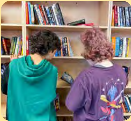
Kids at the Ranch love to read and are excited to have a wider variety of books to choose from!

In the last issue of Ranch Voice, we shared the importance of reading at Dakota Memorial School, and asked for your help in filling the shelves of our school libraries. We're very grateful for our Ranch friends who purchased over 250 books for our Dakota Memorial School libraries and classrooms!