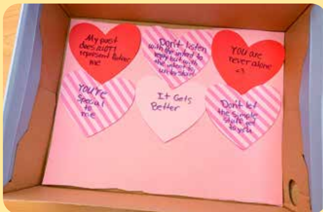
One child included affirmations at the bottom of their box as a reminder of how loved they are.

Kids on our Fargo campus decorated Valentine's Day boxes, which were then filled with notes of encouragement and sweet treats by Ranch staff. For some Ranch kids, this was the first Valentine's box they'd ever had.