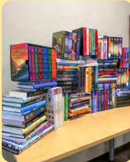
Ranch friends from across the country donated books that will be loved and read by our kids.