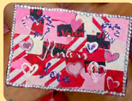
Our kids tapped into their creativity as they decorated their special Valentine's Day boxes.